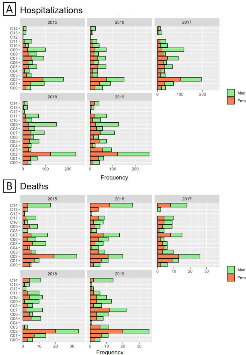
Figure 2. Absolute frequency of hospitalizations and deaths from neoplasms of the oral cavity by year, gender, and location.

Hospitalizations (A) and overall deaths (B) due to malignant neoplasms of the oral cavity in Ecuador, broken down by year, gender, and location. The green bars represent male cases (Msc), and the red bars represent female cases (Fmn).