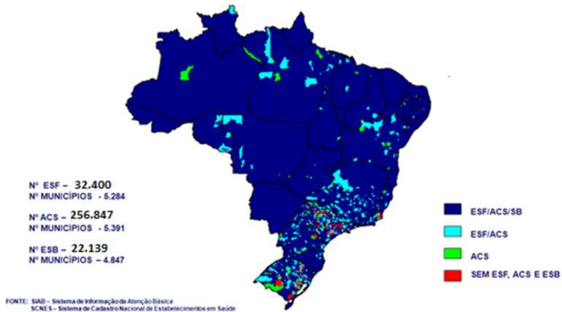
Figure 2. Family health workers (August 2012).